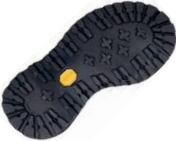
Deep lug style Vibram sole.